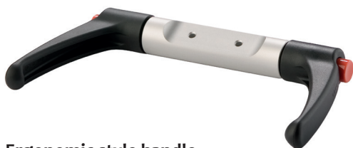
Ergonomic style handle 360° adjustable with disengage knob