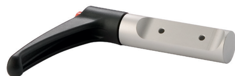
Ergonomic style handle 360° adjustable with disengage knob