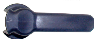
Sterile cover for ergonomic style handle